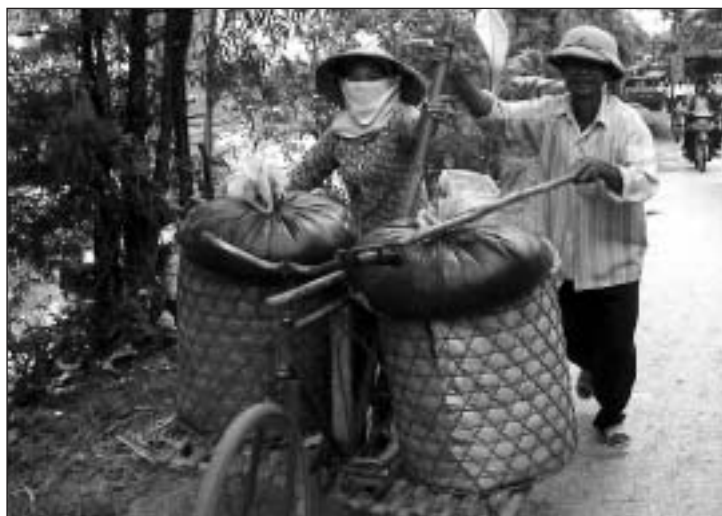
Figure 2: Transport of pig manure by vegetable producers

We have also tried to pinpoint farmers’ preferences for one or another form of organic matter and the determining factors that convince them to choose organic fertilization or feed rather than chemical fertilization or industrial feed. We recount here the results of our surveys and thus it is farmers’ opinions that we will try to bring to the fore. In general, pig manure is considered as being of better quality than organic matter from cattle or buffalo because industrial feeds are of high quality, whereas herbivores have a poor diet, usually grazing on the edges of paddy fields.