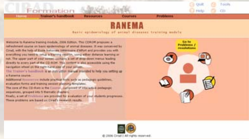
Figure 3: Complete set of training material are available in a CD-Rom for trainers to be able to organise training in epidemiology

In 2005 and 2006, during several training workshops in AI epidemicsurveillance organised by the FAO for Southeast, East and South Asia, Africa, East Europe and Middle East, RANEMA was used as a supplement to increase the impact of the training. This was a new interactive and recreational way to acquire bases in epidemiology. During the course of the workshops, training needs to improve skills and capabilities of the field or laboratory staff in epidemiology and surveillance were clearly expressed and many participants asked to use the tutorial to organise training in epidemiology once back in their country.