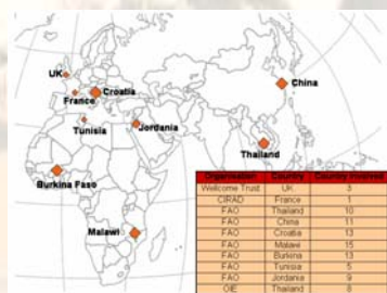
Figure 4: Localisation where training using RANEMA have been already implemented in 2005 and 2006

Although RANEMA is a stand-alone tool, the use of the complete set of training material (CD + book + complementary exercises + pedagogic guidelines) has been maximised by the organisation of a specific training of trainers. Such training was organised by the OIE Regional Representative for Asia and the Pacific in July 2006 for eight countries of Southeast Asia. Participants with sufficient knowledge in epidemiology were identified and targeted to be trainers in their country after having received a specific training of 5 days on how to use this pedagogic teaching-case and how to conduct a clearly determined training sequence.