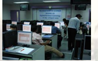
Pictures 1 and 2: Training of trainers in Bangkok in July 2006 for 8 countries of South East Asia organised by the OIE

Although RANEMA is a stand-alone tool, the use of the complete set of training material (CD + book + complementary exercises + pedagogic guidelines) has been maximised by the organisation of a specific training of trainers. Such training was organised by the OIE Regional Representative for Asia and the Pacific in July 2006 for eight countries of Southeast Asia. Participants with sufficient knowledge in epidemiology were identified and targeted to be trainers in their country after having received a specific training of 5 days on how to use this pedagogic teaching-case and how to conduct a clearly determined training sequence.