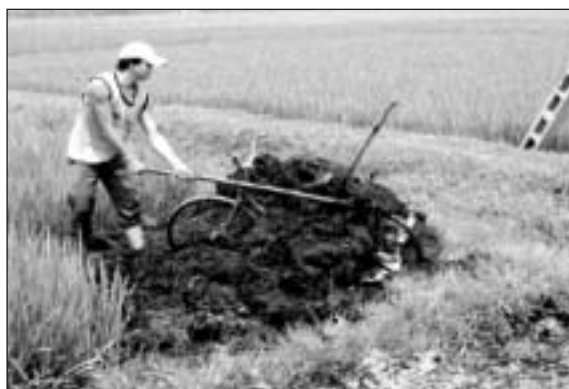
Figure 2: Characteristic of organic fertilizer

The quality of organic fertilizer depends on many factors such as on-farm practices and proportion of crop residues incorporate during the composting process. Moreover, solid waste management techniques and characteristics of crop residue mixed in pig manure also affect the quality of organic fertilizer. Difference of process in managing the pig waste among farmer households has given different types of organic fertilizers before applying for crops on the field.