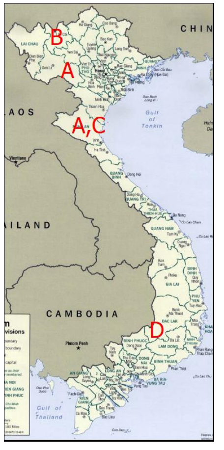
Figure 2: Distribution of major local breeds in Central Vietnam

Upper case letters mark distribution area of pig breeds: A = Meo/Ban pig, B = Muong Khuong pig, C = Co pig, D = Soc pig