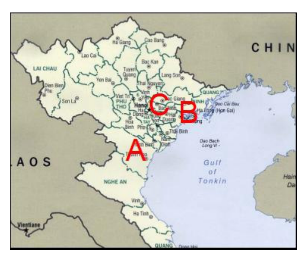
Figure 1: Distribution of major local breeds in Northern Vietnam

(Upper case letters mark distribution area of pig breeds: A = I pig, B = Mong Cai pig, C = Lang Hong pig