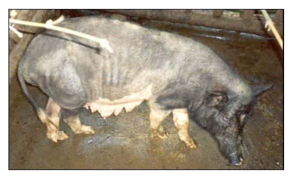
Figure 4: Ban sows

The Meo is well adapted to the local ecologies and socio-economies of the H'mong people (Ly, 1999). Meo pigs resemble wild boars. They have no potbelly and a straight back (Figure 4). Thai farmers describe three local varieties differing in size, appearance of white marks (snout, tip of the tail, legs), reproductive performance and growth rate (Lemke et al., 2000). For Meo pigs of the H'mong, six phenotypic groups have been described, which might represent sub- or eco-types (Huyen, 2004).